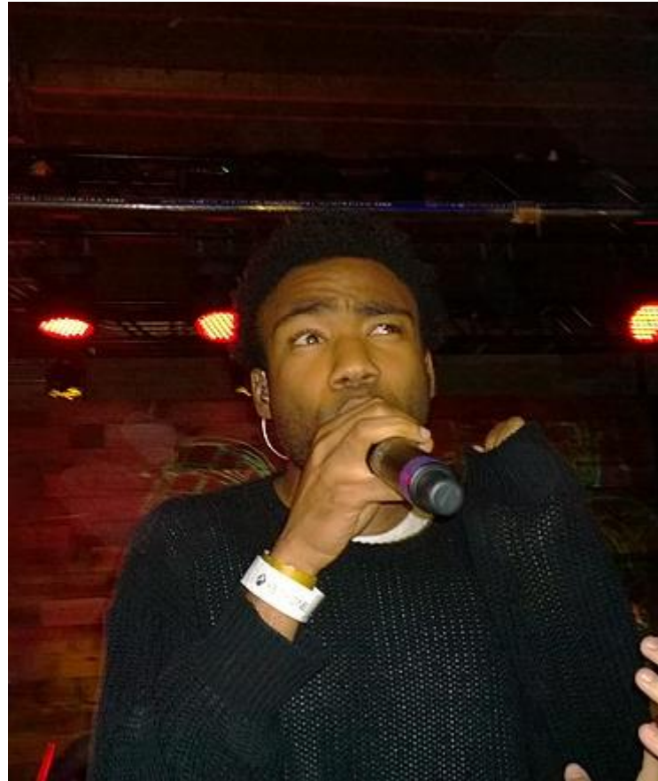
Childish Gambino @ South by Southwest 2014