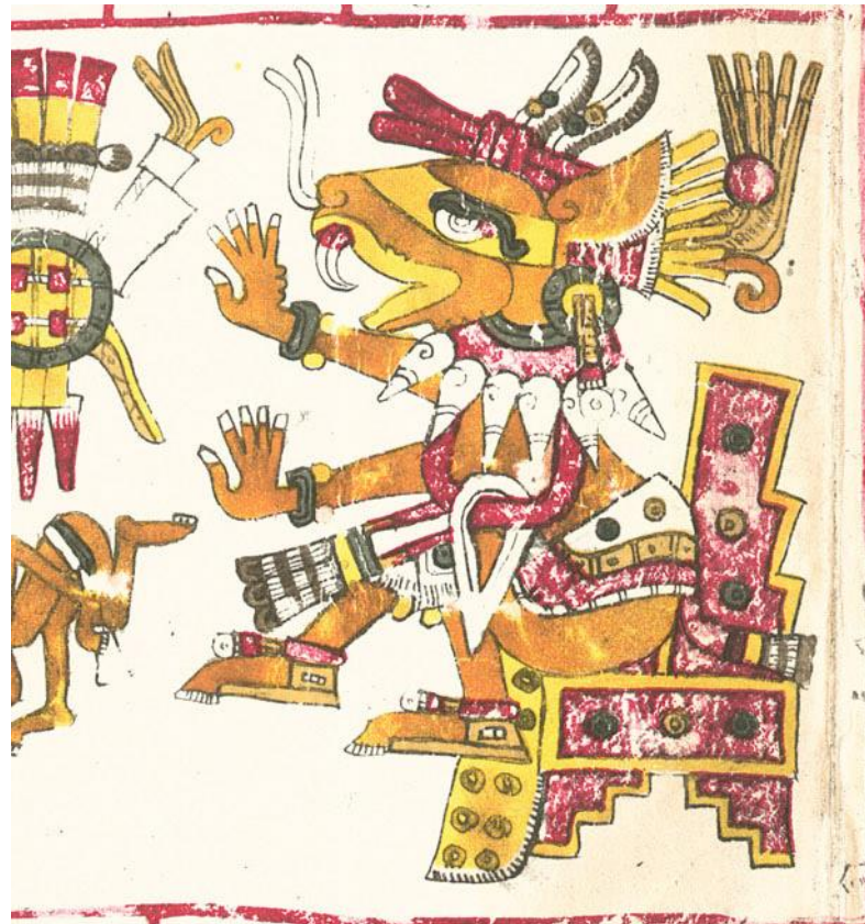
Very Old Coyote