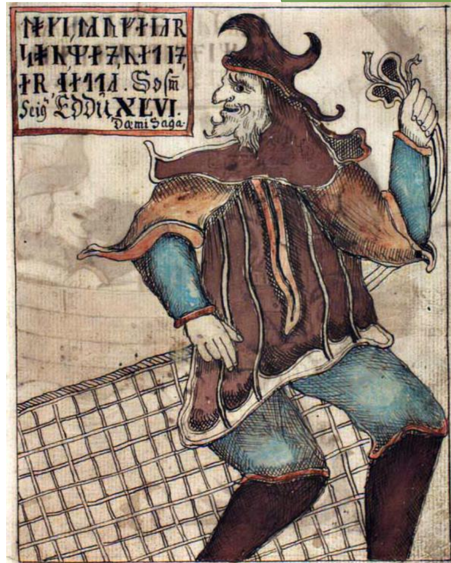
“Loki” Icelandic 18 th century ©